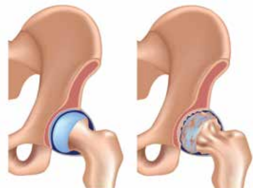
Healthy Hip Joint

Osteoarthritis develops when changes in cartilage occurs caused by wear and tear. This then affects how the joints work and can cause the joint to become stiff and painful to move. Sometimes part of the cartilage can break away from the bone leaving the bone ends exposed. Bones may then rub against each other and the ligaments become strained and weakened. This causes a lot of pain and changes the shape of the joint. The symptoms of arthritis can vary depending on the degree and area of wear.